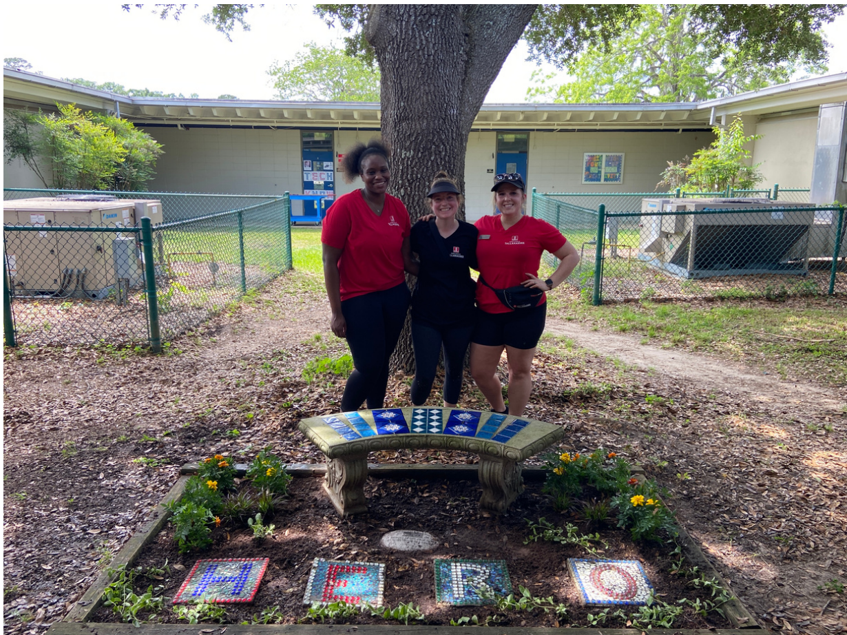
The Junior League at Sabal Palm Elementary