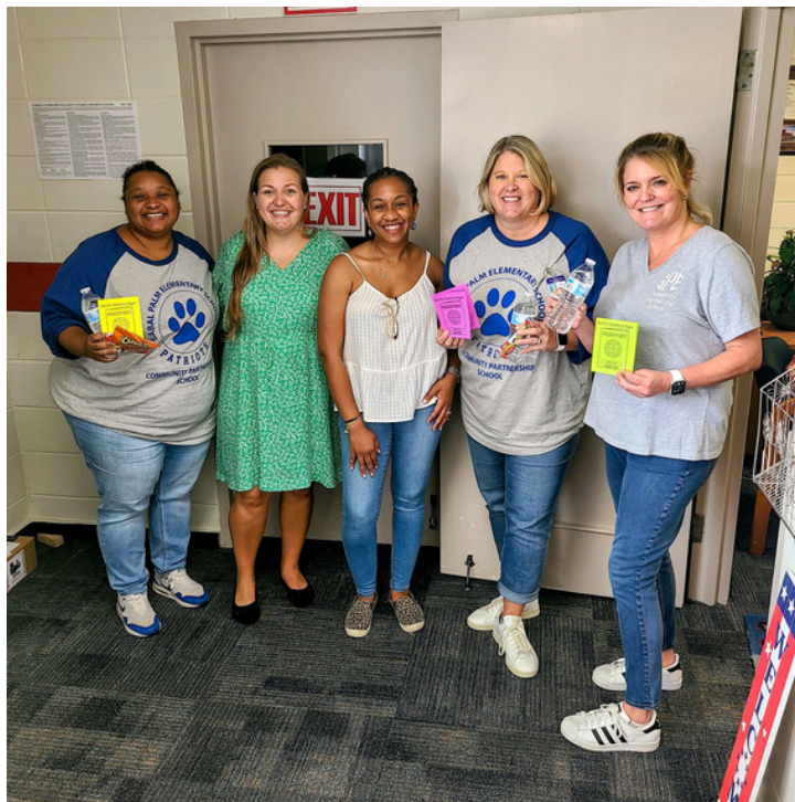
The Junior League at Sabal Palm Elementary