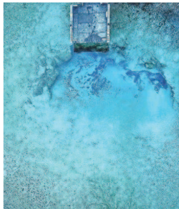
Deep Blue Down is part of the "Beloved Florida" exhibit at Tallahassee Museum. JR HARDING