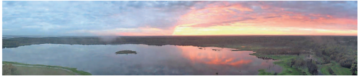
Florida Risen is among the photos at "Beloved Florida" exhibit at Tallahassee Museum.